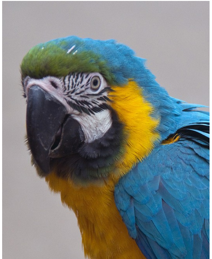
Flower Market Visitor