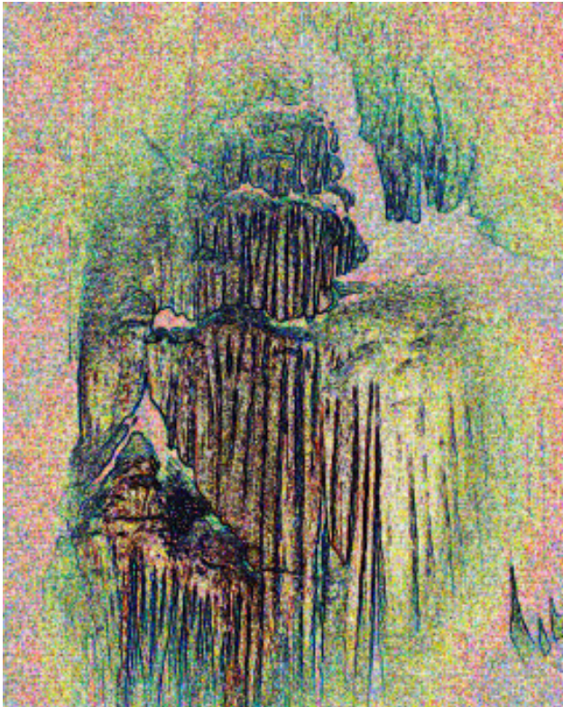
Stalagmite (find edges)