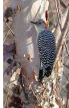
"Woodpecker" by Pat Roshaven